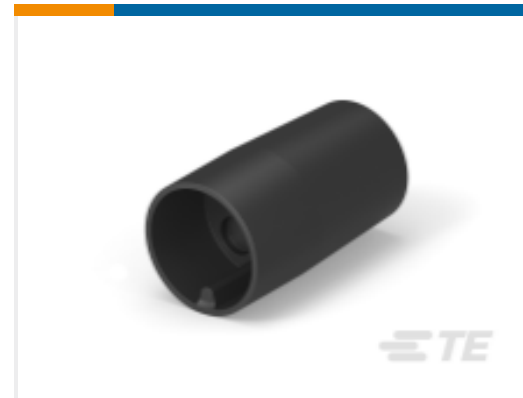
TE Part # 925075-3 4W CIRCULAR MATE-N-LOK PIN HSG BLK