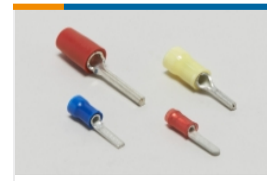
Crimp Wire Pins, Tabs & Ferrules(2)