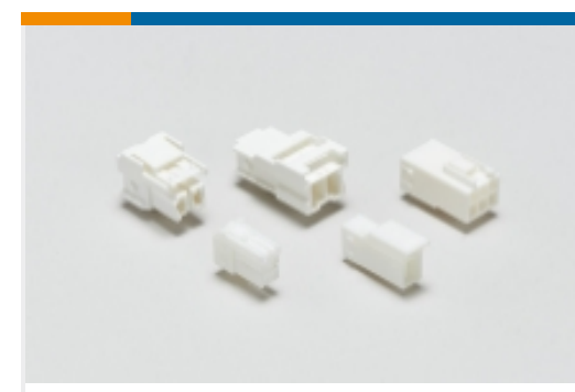
Rectangular Power Connectors(167)