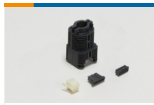
Rectangular Connector Housings(9)