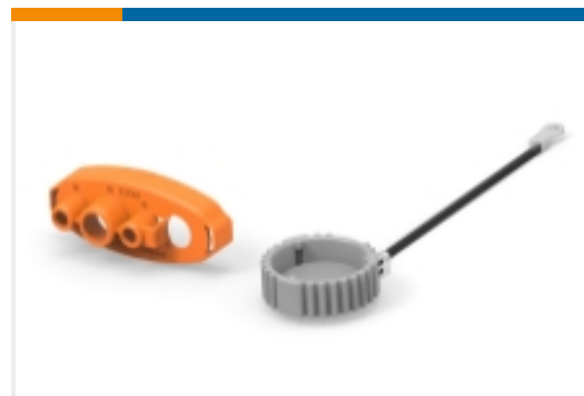
Connector Caps & Covers(2)