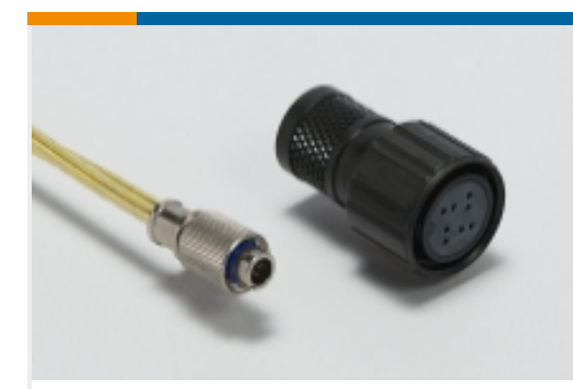
Standard Circular Connectors(2)