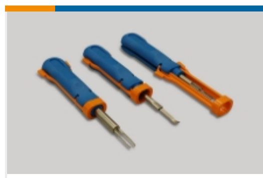
Insertion & Extraction Tools(3)