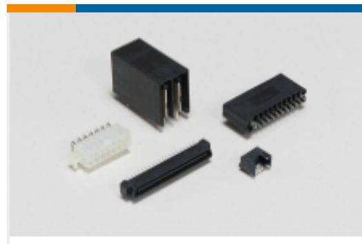
Standard Rectangular Connectors(7)