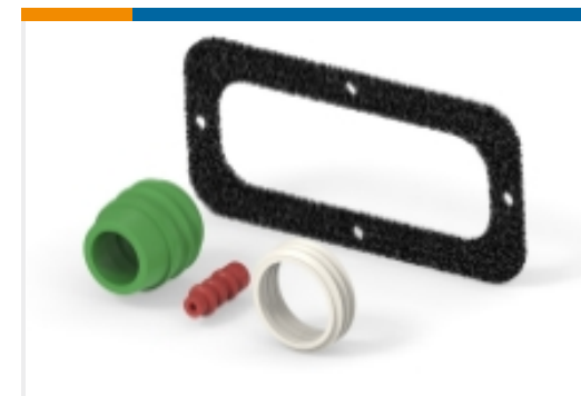
Connector Seals & Cavity Plugs(1)