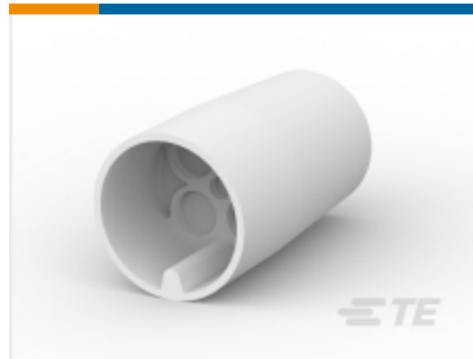
TE Part # 925075 4W CIRCULAR MATE-N-LOK PIN HSG NAT