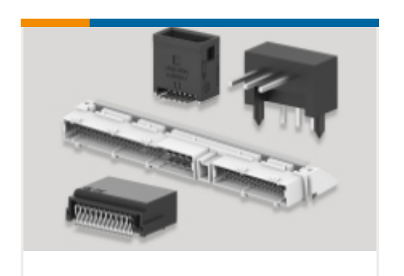
PCB Headers & Receptacles(143)