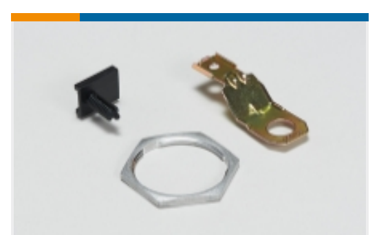
Other Automotive Connector Accessories(7)