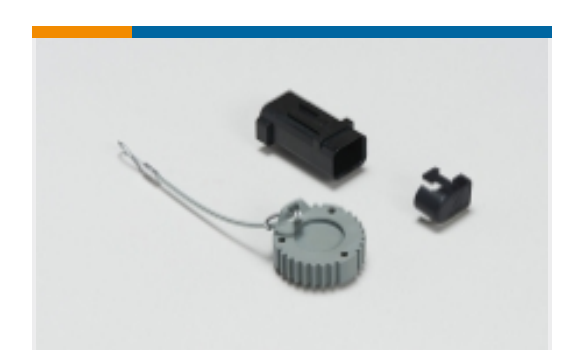
Automotive Connector Caps & Covers (111)