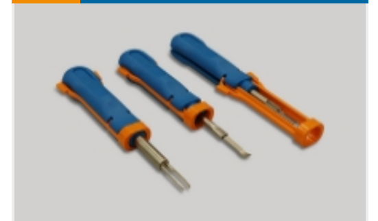
Insertion & Extraction Tools(42)