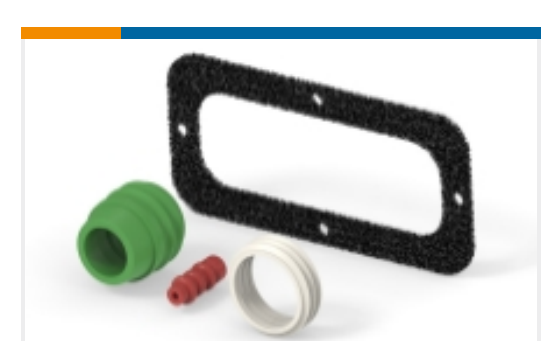
Connector Seals & Cavity Plugs(25)